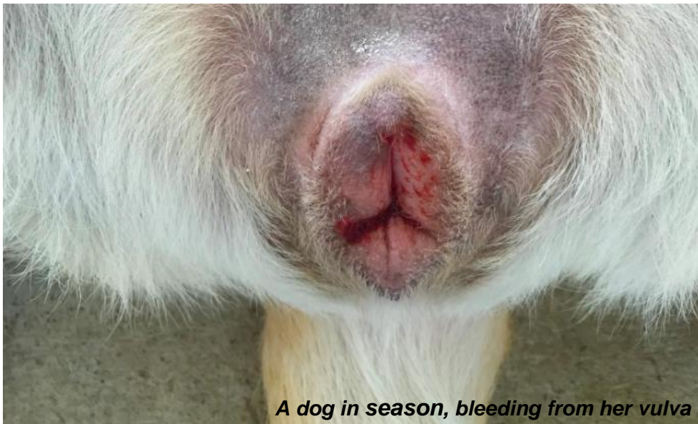
A dog in season, bleeding from her vulva

A heat (or season) is when a female dog is fertile and can become pregnant. During a heat, it's likely that your dog will behave differently, bleed from her vulva, and become very interested in male dogs.