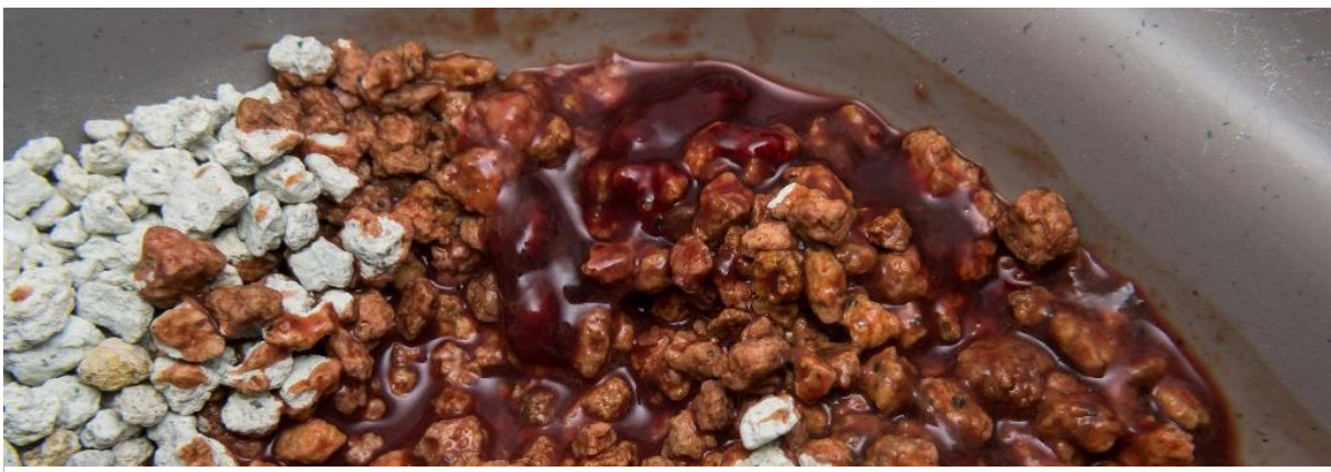
Diarrhoea (containing blood) from a cat with FPV.