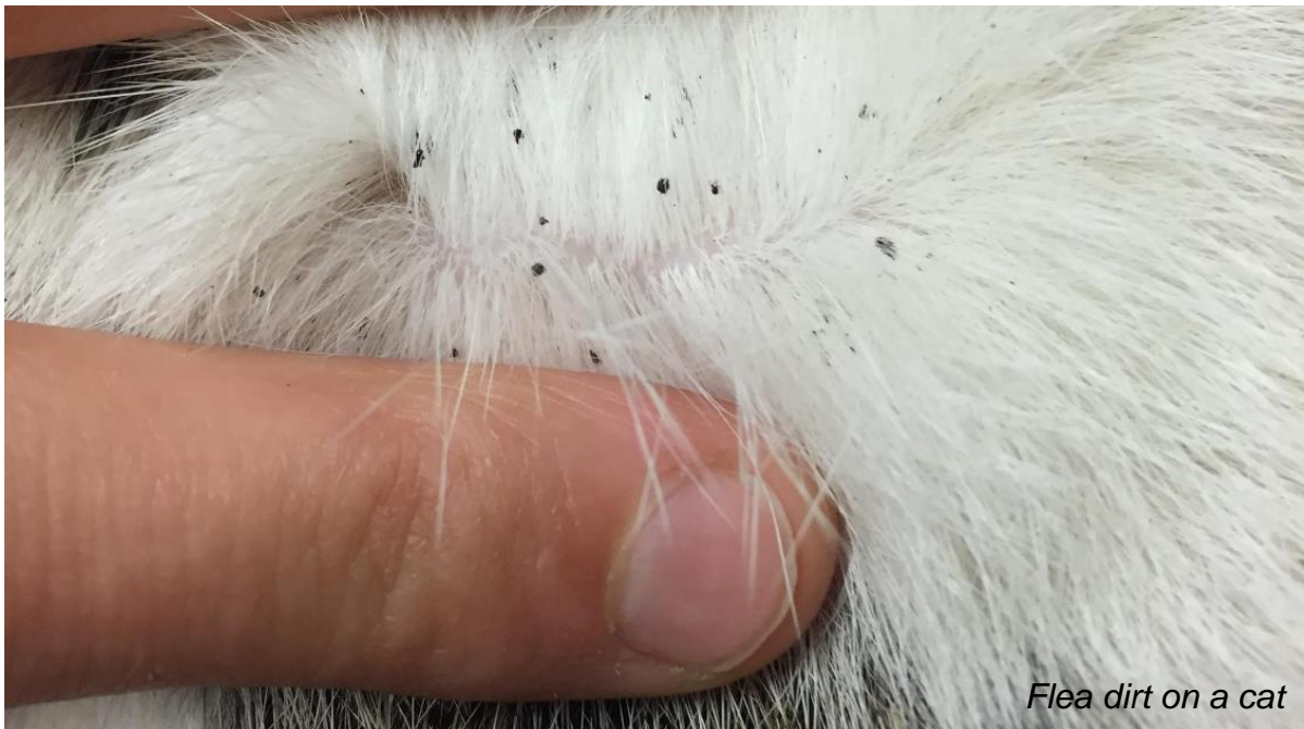
Flea dirt on a cat