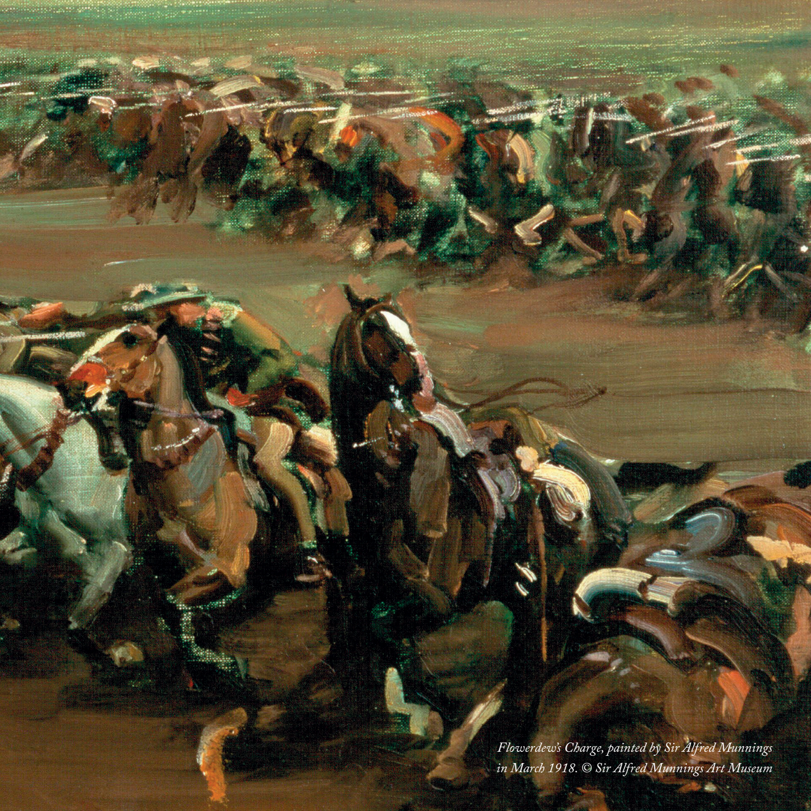
Flowerdew's Charge , painted by Sir Alfred Munnings in March 1918. © Sir Alfred Munnings Art Museum