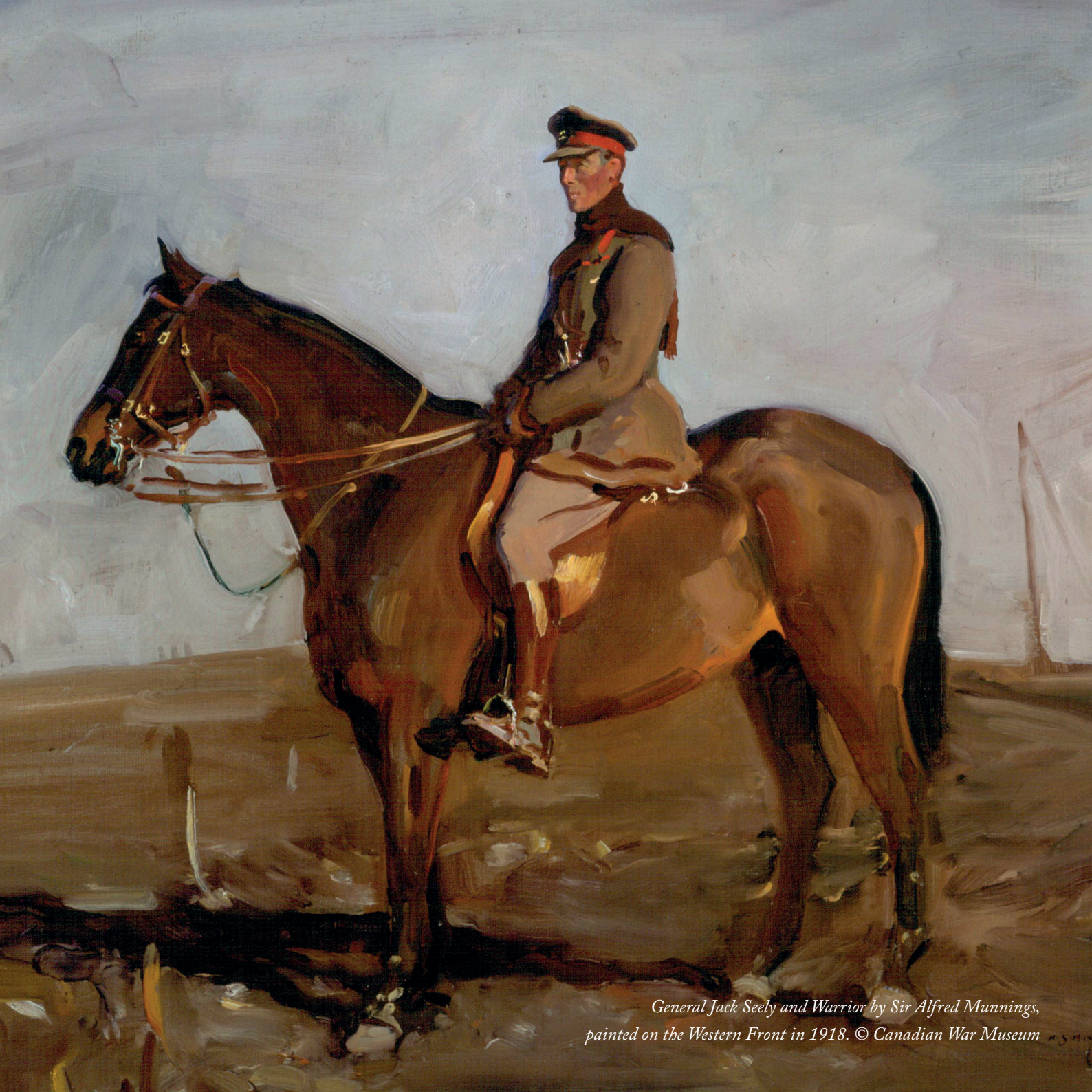
General Jack Seely and Warrior by Sir Alfred Munnings, painted on the Western Front in 1918.