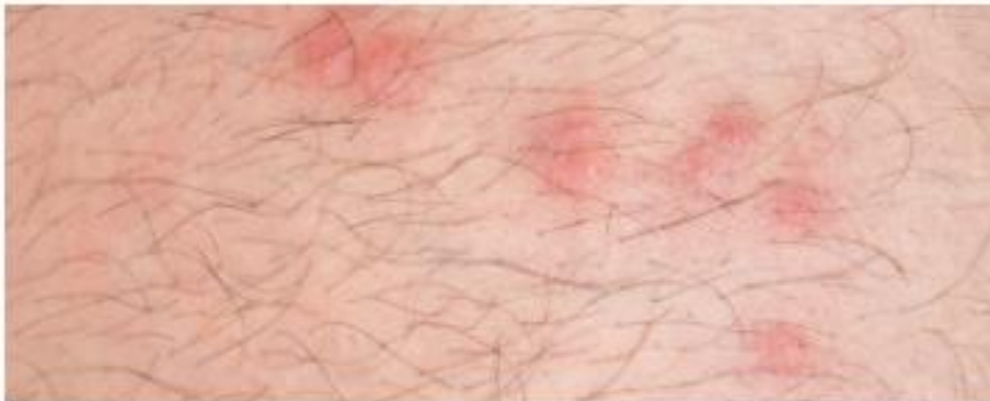
Flea bites on a human leg

See the NHS website for more information on human insect bites.