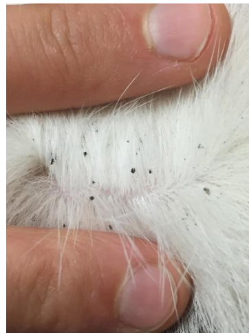
Flea dirt in fur