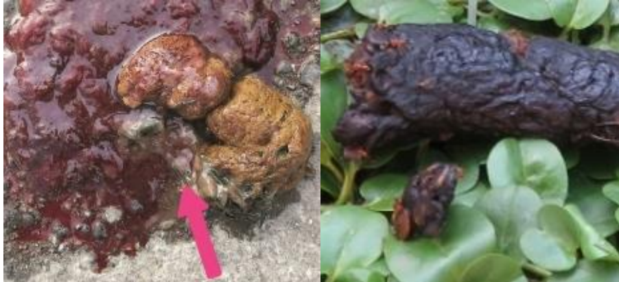
Fresh blood in a dog's poo (left)

photographs). You may even see blood dripping from your dog's bottom after they have been for a poo.