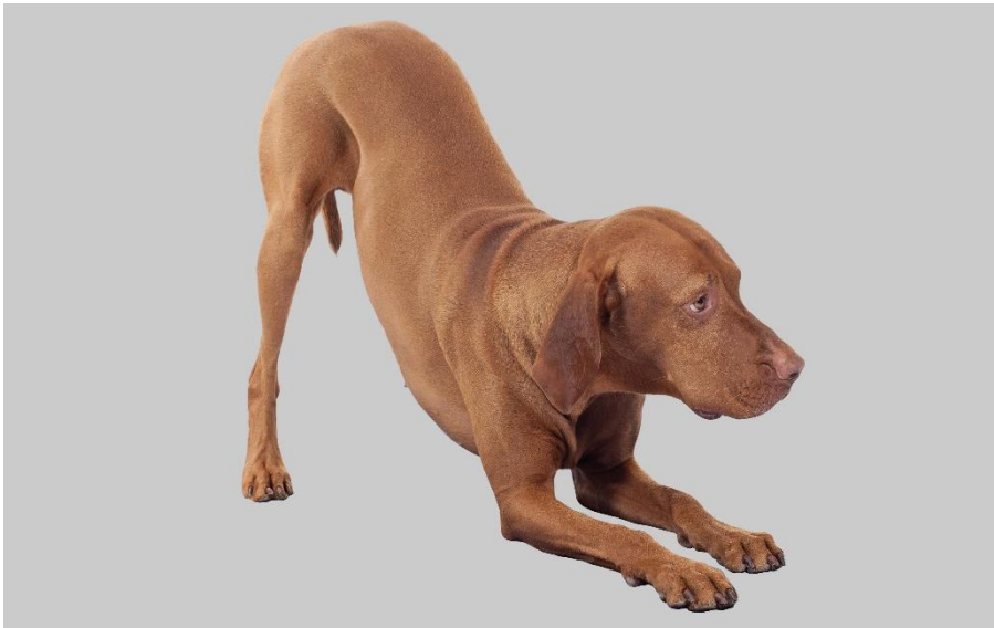
Dog sitting in the prayer position due to pain in his abdomen.