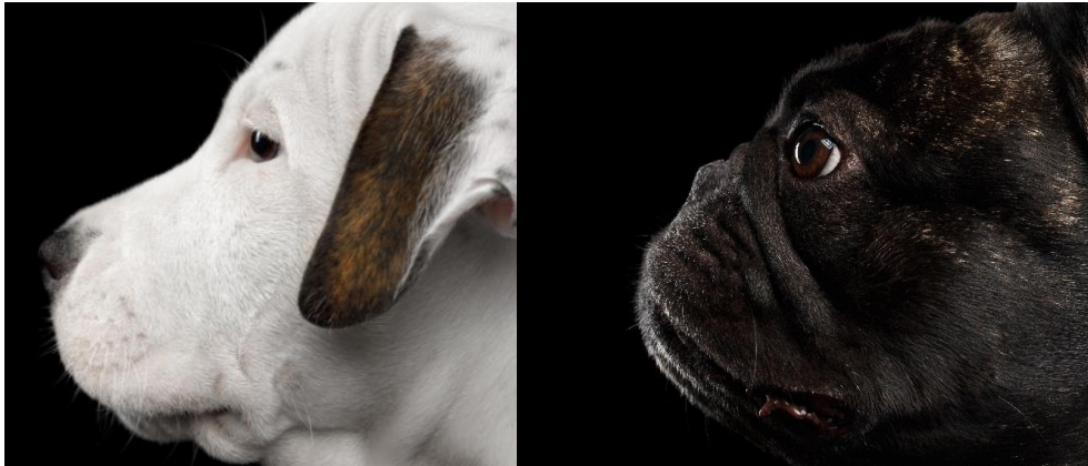
The shape of a dog's face and skin can make them more prone to skin fold dermatitis